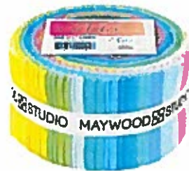
Gelato Ombre Maywood Studio