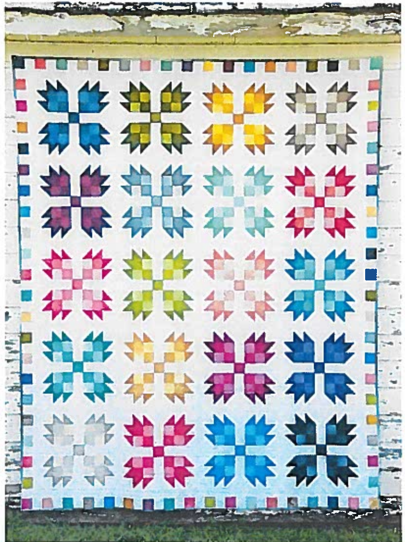
Quilt measures 70" x 86"