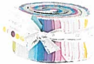
Ombre V and Co