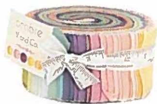
Ombre V and Co