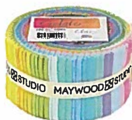
Gelato Ombre Maywood Studio