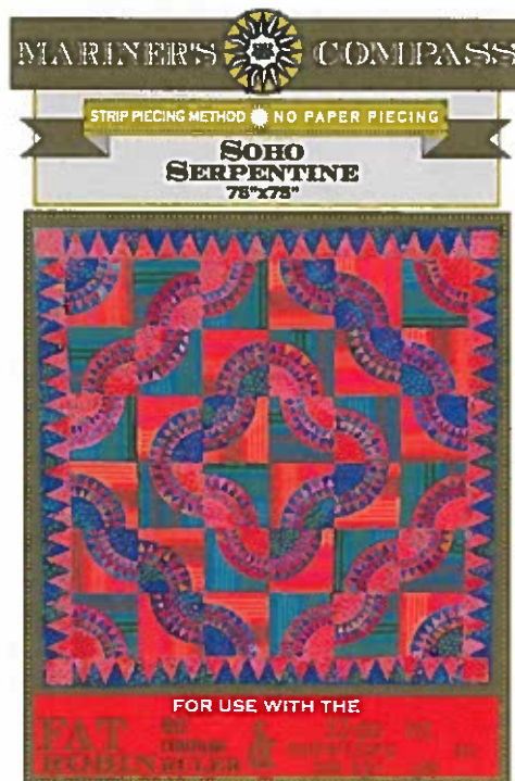
WWW.ROBINRUTHDESIGN.COM Soho Serpentine 75"x75" Fat New York Beauty Blocks