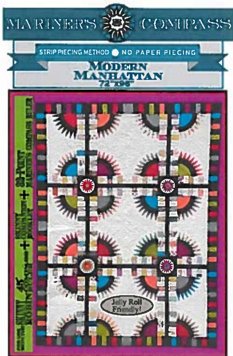
WWW.ROBINRUTHDESIGN.COM Modern Manhattan 72"x96" Skinny New York Beauty Blocks

Student's choice of Modern Manhattan OR Soho Serpentine pattern.